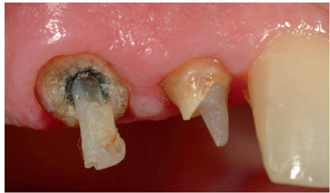
Figure 2. Restoration failure on maxillary right canine and lateral incisor with debonding of partial removable dental prosthesis abutments crown, microleakage, and secondary caries. Both teeth were successfully restored again.

The failures were evaluated with respect to several parameters: arch, (maxillary or mandibular), position in the arch (anterior or posterior), type of definitive restoration, and mode of failure. The null hypothesis that the success rate of quartz fiber post restorations is independent of these parameters was rejected. The statistical analysis identified the interaction of the factors related to "arch" and "position in the arch" with the success rate. The teeth in the maxillary arch showed a statistically higher failure rate than those in the mandibular arch. These data are in agreement with a study on different fiber post types, 29 which also showed increased maxillary failure rates and increased maxillary failures in the posterior teeth. The latter finding was also confirmed in the present study: among the 12 failures in